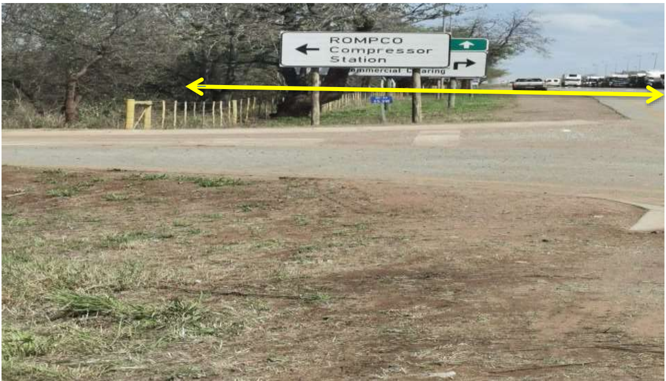
Plate 4: Photo 4 shows the point in which the proposed gas pipeline will cross N 4 road to connect to an existing Rompco pipeline (Author 2020). S25^{\circ}26'46'15'' E31^{\circ}56'17,35'' (T-off N 4 towards Rompco compressor station).