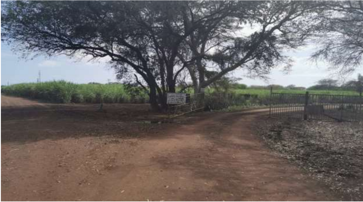
Plate 1. Reflect the sugarcane plantation which will be affected by the proposed Tau gas plant at S25^{\circ}26'15,54'' E31^{\circ}56'39,25''