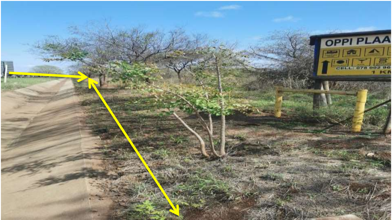
Plate 3: Photo 3 shows a T-off point of the proposed gas pipeline to run parallel the N 4 towards the Rompco Compressor station. (Author 2020). S25^{\circ}26'46,8 E31^{\circ}56'32,56'' (Parallel N 4 ).