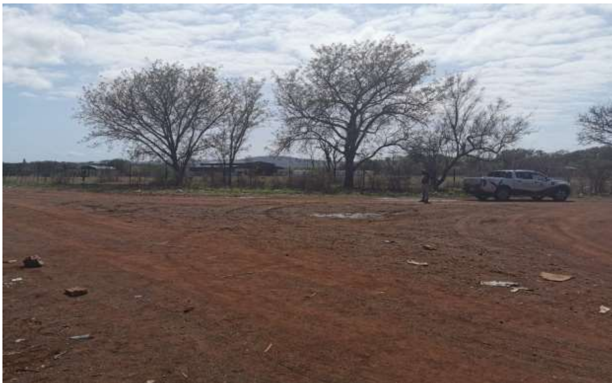
Plate 2: Photo 2 shows the point whereby the proposed new gas pipeline will connect to the existing towards the proposed plant (Author 2020). S25^{\circ}26'28,98'' E31^{\circ}56'36,33'' (T-off of Hotchkiss Street).